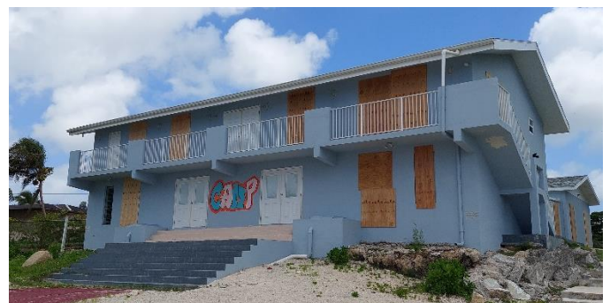
The Prospect Youth Centre ready for the storm

As Hurricane Beryl passed near Jamaica and the Cayman Islands on July 3-4, 2024, we are grateful to God for being spared from the hurricane's full force. While we avoided significant damage in Cayman, the impact on some communities in Jamaica remains substantial. Unfortunately, the Children's Camp in Jamaica, scheduled for July 6-11, 2024, had to be postponed and will be reassessed. Here in Cayman, we plan to proceed with the Children's Camp starting on July 9 and the Teen's Camp on July 16.