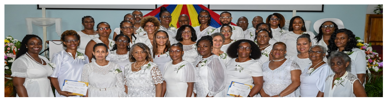
A fraction of the 2022 Lay Leaders Module 1 graduating class.