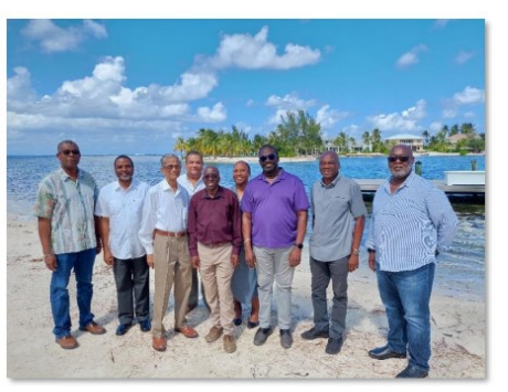
Group photo from the Moderator's Retreat with Ministers and Lay Pastors in Cayman Kai

The Moderator and the General Secretary concluded their visit to the CIRMC on October 31, 2022.