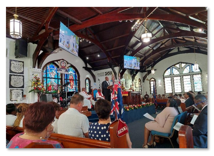
The Anniversary Service at the Elmslie Memorial Sanctuary.