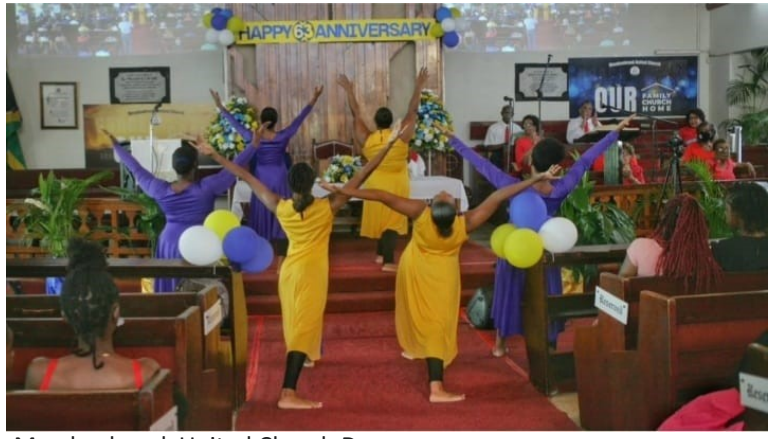
Meadowbrook United Church Dancers.

The service was further enriched by offerings from he MUC Dancers and the Hands of Praise Ministry. We continue to give God the Glory as we continue to shine His beacon in the community.