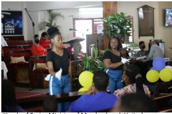
Hands of Praise Ministry of Meadowbrook United