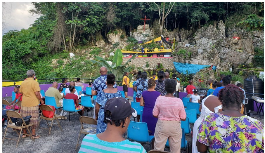
The audience participating in the dedication of the garden.