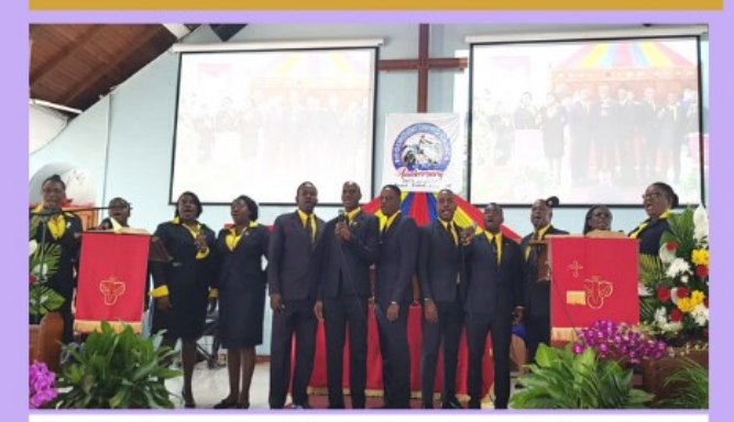
The Jamaica Constabulary Force , JCF, choir ministering in song.