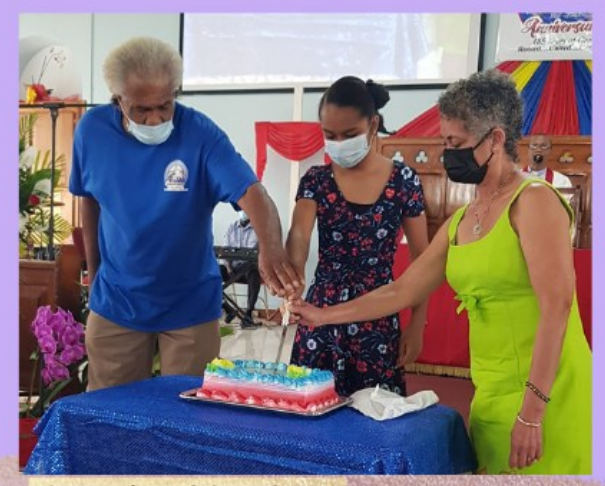
The cutting of the cake.