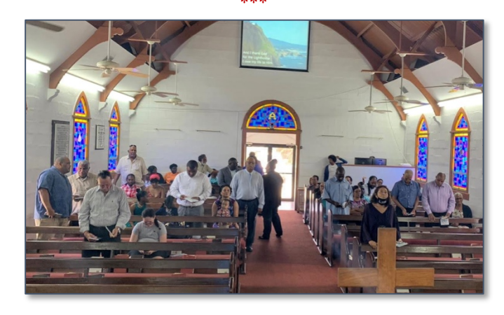
Fathers receive their tokens at the Father's Day Service at the Webster Memorial United Church in Bodden Town.