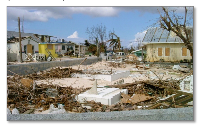
View of Bodden Town in September 2004, following Hurricane Ivan.

this may depend on the extent of damage to communication systems as well as personal circumstances.