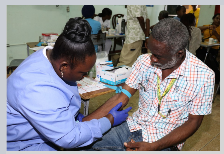
Joint efforts with the Women's Fellowship to stage a national health fair.