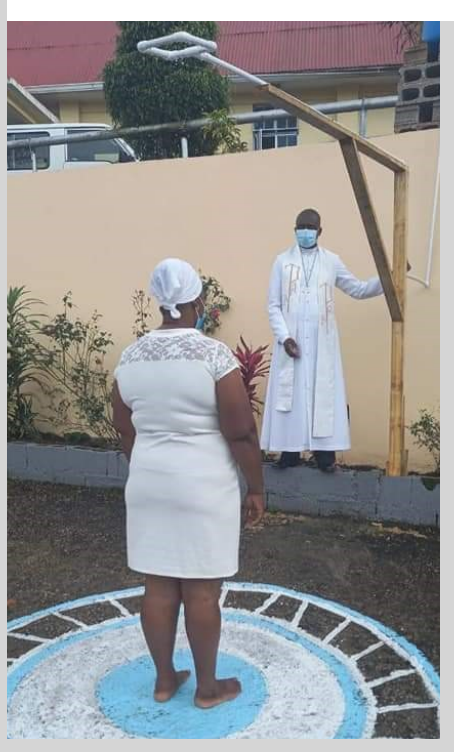
Baptismal shower innovation at Lowe River United Church.