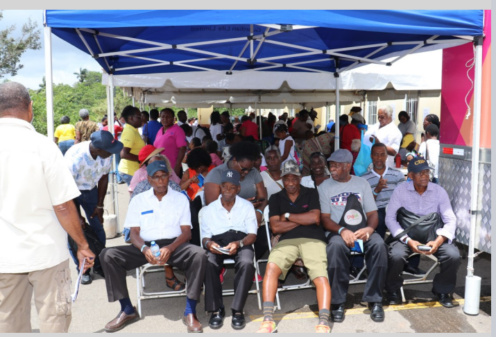
Prostrate screening was a feature of the health fair. The Men's

The Men's Fellowship is acutely aware that there are several avenues for it to improve its organizational structure and, ultimately, its reach to all the men of the church. Those activities have already started. The internal communication structure has been improved, and it has already yielded significant benefits. Look out for the Men's Fellowship newsletter, which will be circulated in short order!