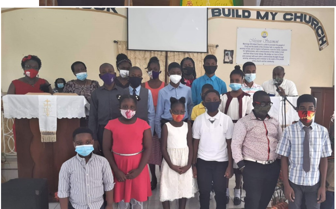
Members of the Youth and Children's Department at Mannings Hill United Church.