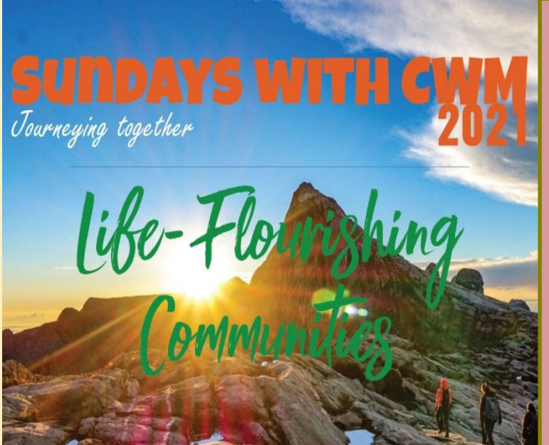
Devotional available from the CWM website <u>https://www.cwmission.org/wp-content/uploads/2021/01/Sundays-with-</u> <u>CWM-2021.pdf</u>