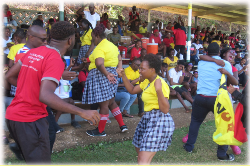
Spectators of the North-Eastern Regional Mission Council celebrate after their region won a race.

"The purpose of the United Church in Jamaica and the Cayman Islands (UCJCI) has been summarized in our Vision "Touching Lives, Nur turing Disciples, Seeking Transformation through Christ." We aim for our ministry to be for "all people", seeking to invite, encourage, and help everyone to become disciples of Christ, while seeking, at all levels, to meet their needs."