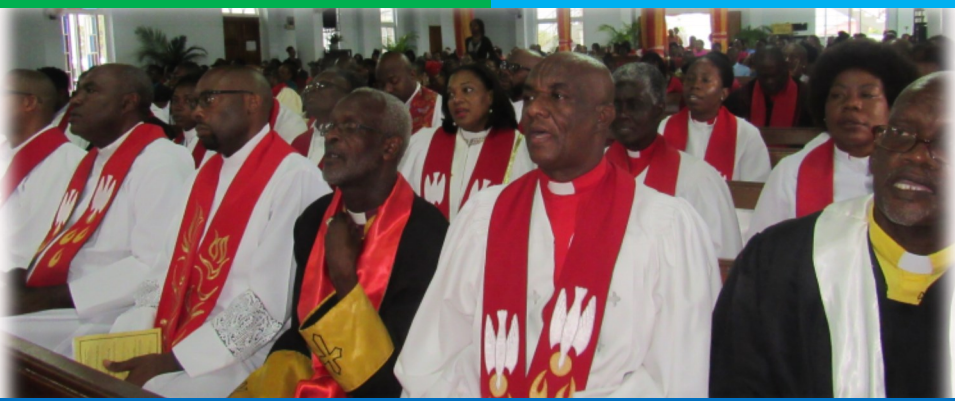
UCJCI Ministers and a section of the congregation