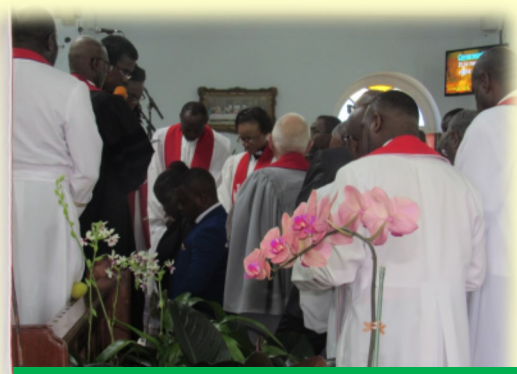
The blessing and ordination by fellow Ministers

Just as the Apostle Paul saw potential and promise in young Timothy, our Moderator (Continued on Page 2)