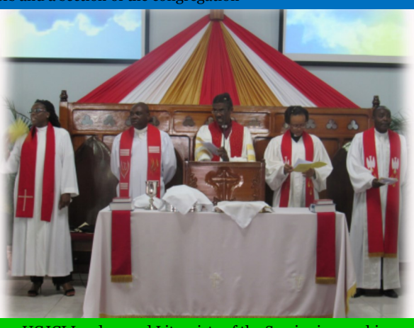
UCJCI Leaders and Liturgists of the Service in worship

Send comments and news about your congregation to: ucjciupdate@gmail.com