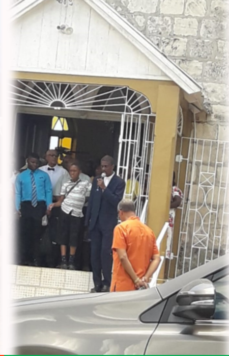
The Moderator engages the people in prayer at Stirling United Church, Westmoreland

Send comments and news about your congregation to: ucjciupdate@gmail.com