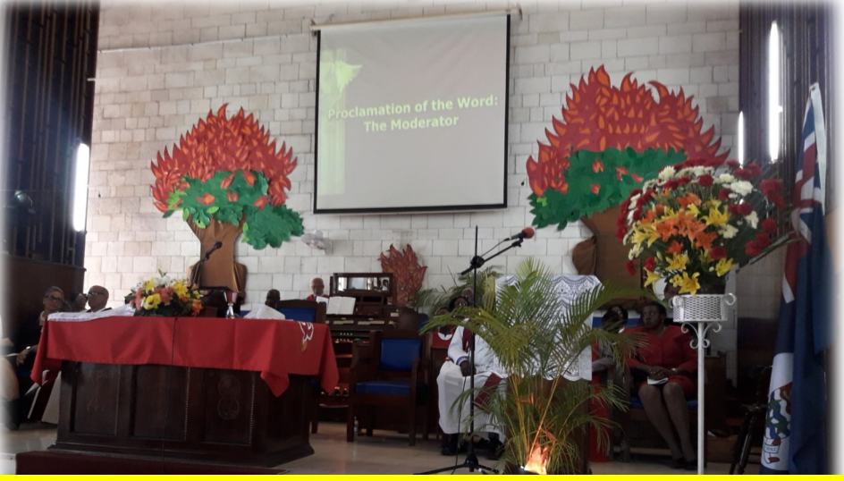
Replicas of The Burning Bush , the Motif of the 41st Synod , signifying the rekindling of our passions for the cause of Christ