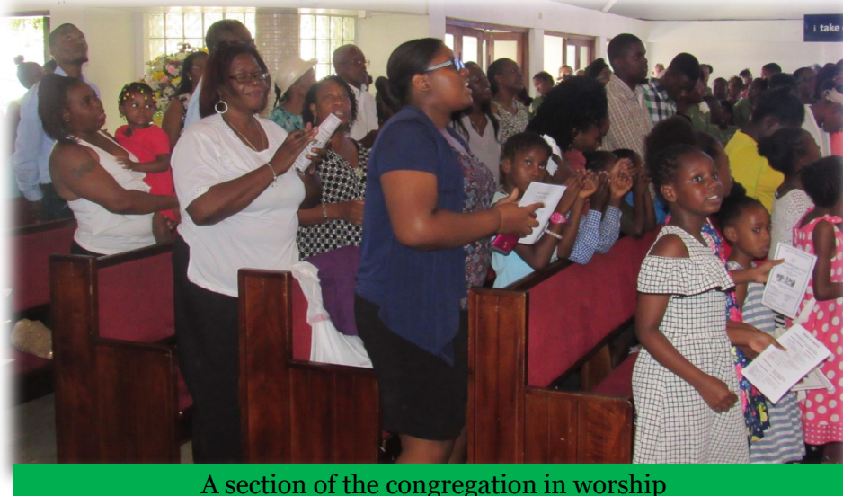
Shortwood United Church in Dance!