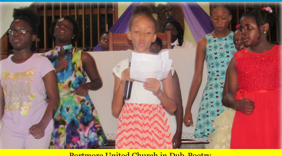
Portmore United Church in Dub-Poetry

Send comments and news about your congregation to: ucjciupdate@gmail.com