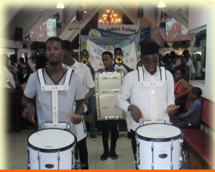
Webster Memorial United Church's Boys' Brigade

Blessed are the children among us. May God continue to nurture and use them for His glory!