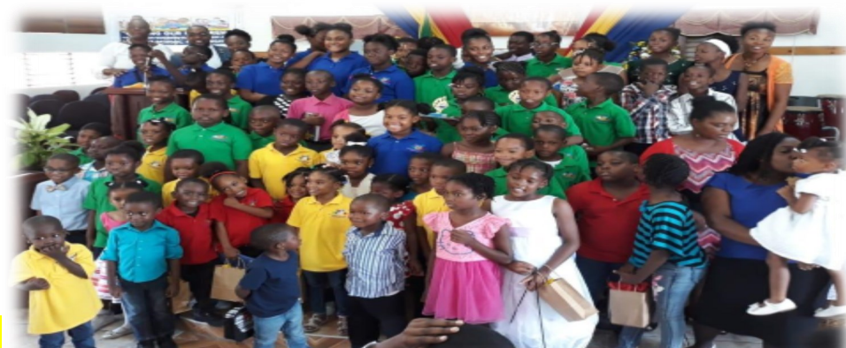
Children gathered together on Church School Sunday at Portmore United Church!

Send comments and news about your congregation to: ucjciupdate@gmail.com