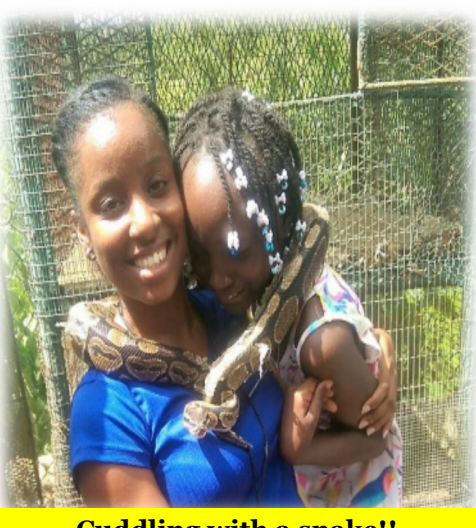
Cuddling with a snake!!

(Dedicated to: The Leaders and Campers of Iona Children's Camp '77)