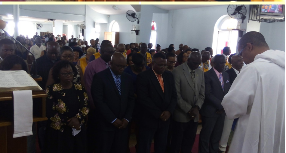
The Lions Club and the Parish Council in full representation being prayed for at